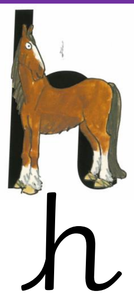
Bouncy Sound: h, h, h, horse Down the head to the hooves and over his back Handwriting Family: r